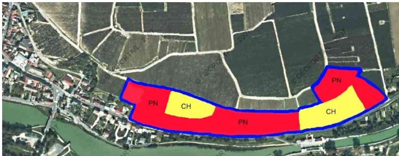
Only Pinot Noir and Chardonnay are grown on Les Goisses, though the balance has shifted over the years in favor of the former

The yield for Clos des Goisses is very modest in Champagne terms, averaging around 10,000 kilos per hectare. Even in a record year like 2004, when Champagne averaged a massive 23,000 kilos, it was just 12,000 (Pinot Noir) to 13,000 (Chardonnay) for Clos des Goisses. In a tiny vintage like 2003, when Champagne averaged just 8,250 kilos, Clos des Goisses yielded a mere 700–1,200 kilos, depending on the parcel. The vinification has changed over the years, but chaptalization has never been necessary, and malolactic has always been avoided. In recent decades much if not all of the wine was vinified in large wooden foudres , but since the 2000 harvest between 30 and 45 percent of the wine has been fermented in 225-liter barriques of between two and five years of prior use. The first fermentation takes place at 68°F (20°C), the wine is cold-stabilized, kept on fine lees, and racked once before the assemblage in March. Following a light filtration, the wine is bottled in April or May, and stored in the coolest part of Philipponnat's cellars, where it undergoes second fermentation at 54°F (12°C). Most vintages receive a dosage of 4.5g of residual sugar per liter and nine months post-disgorgement aging prior to shipment.