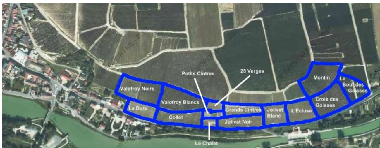
Within Les Goisses there are 11 lieux-dits , subdivided in-house by Philipponnat into 14 plots